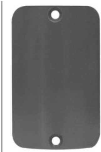
HHC for LEX TYPE LS1 <color> 5 1/4" x 3 1/4" Hole to hole 4 1/2"