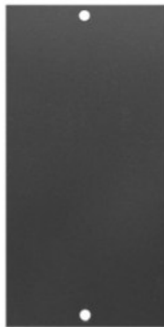
HHC for LEX TYPE LS2 <color> 6" x 3" Hole to hole 5 1/2"