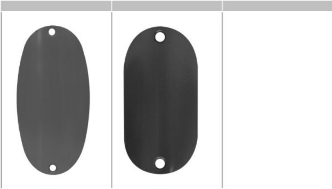
HHC for LEX TYPE LR1 <color> 8" x 4" Hole to hole 7"