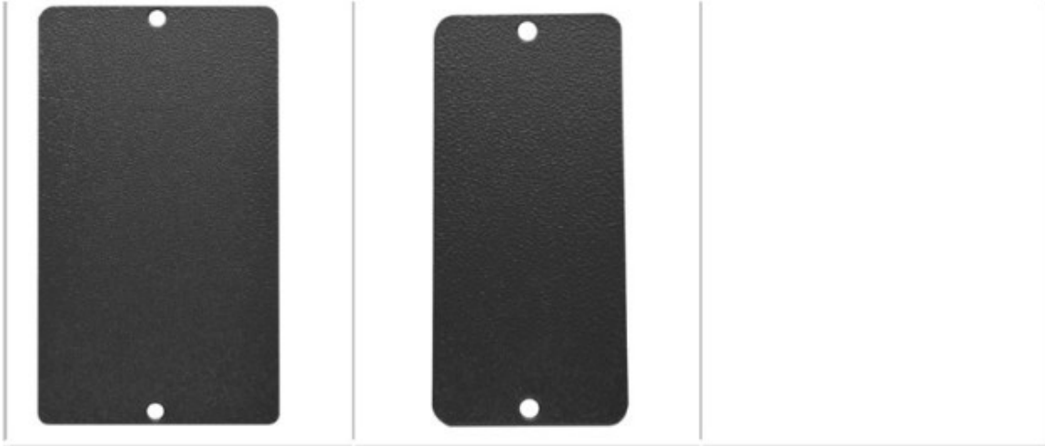
HHC for HAP TYPE HS1 <color> 6 1/4" x 3 1/2" Hole 6" Apart